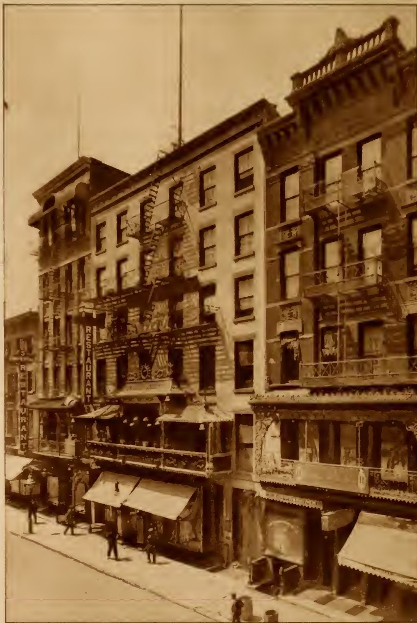
CHINATOWN. Name given to section of downtown district on Mott Street, including Chatham Square and vicinity. Sightseeing "busses" carry visitors here.